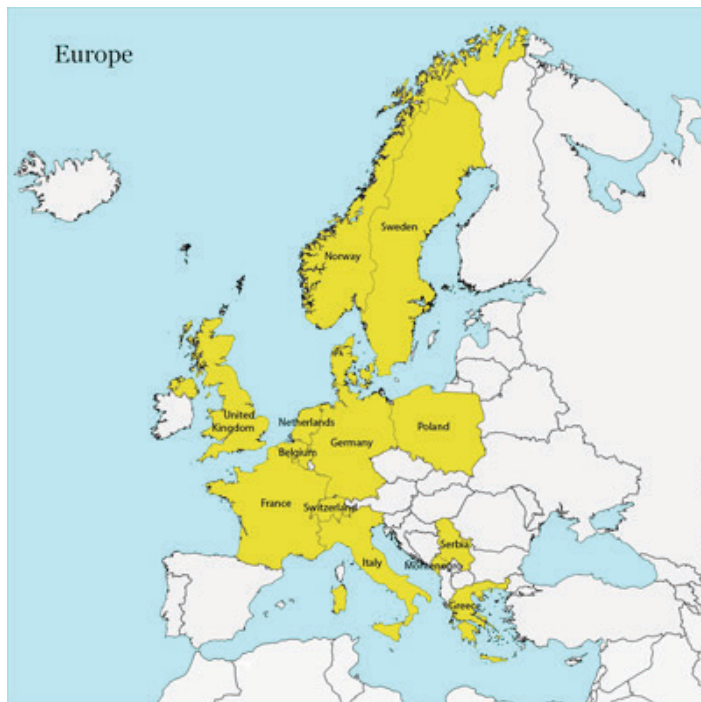
Figure 2. European countries are marked in yellow if they have documented presence of the chicken mite, Dermanyssus gallinae (De Geer).

After the first molt, both nymphal stages have eight legs, as do the adults. The protonymph, deutonymph, and adult females routinely feed on host blood, while males only feed occasionally (Chauve 1998).