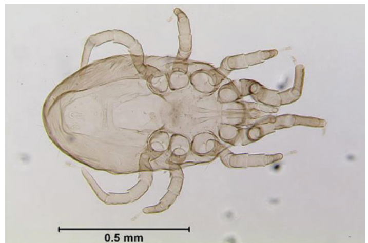
Figure 1. Adult chicken mite, Dermanyssus gallinae (De Geer).

Chicken mites are distributed worldwide. In many countries, Dermanyssus gallinae poses a threat to birds used for meat and egg production. They are found in many areas including Europe, Japan, China, and the United States. In the United States, Dermanyssus gallinae is rarely found in caged-layer operations and is more commonly found in breeder farms (Ruff 1999). Although Dermanyssus gallinae affects birds in many regions, it is most prevalent in European countries (Figure 2).